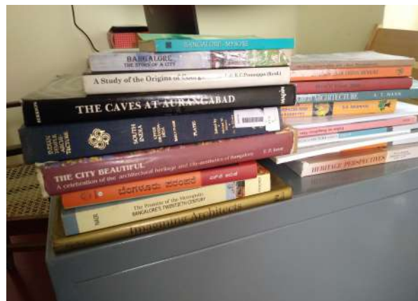
Books, books, books - on Bengaluru, history, architecture, trees and more!