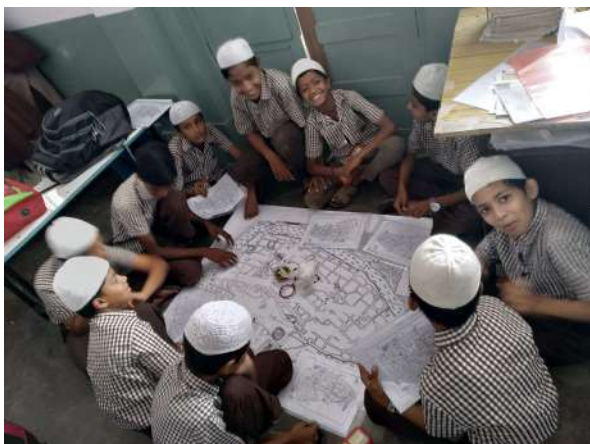
At the RMES school in Goripalya.